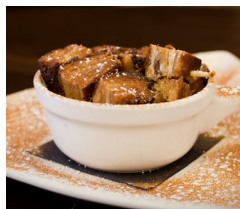
BREAD PUDDING 7