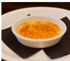
CRÈME BRÛLÉE 6